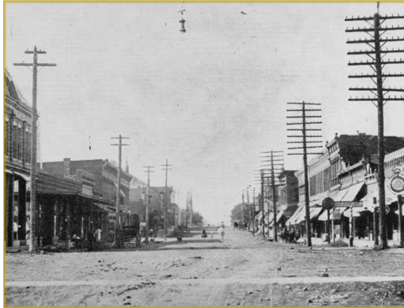
WALT'S HOME TOWN MARCELINE, MISSOURI (c. 1905)