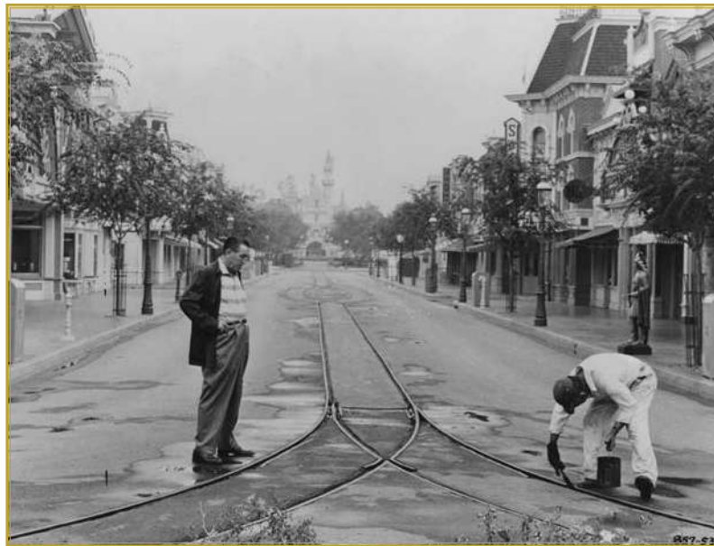
MAIN STREET, U.S.A. DISNEYLAND PARK, CALIFORNIA (1957)