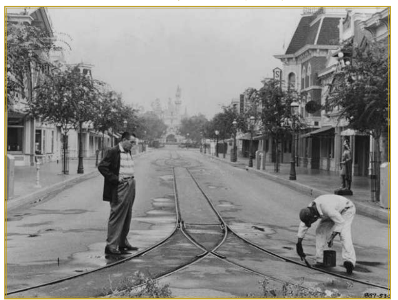
MAIN STREET, U.S.A. DISNEYLAND PARK, CALIFORNIA (1957)